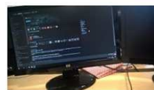
Figure 3: Becoming part of it: Joining a society