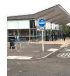
Figure 4: New beginning: start of my journey