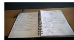
Figure 2: My new normal: regular day of note-taking