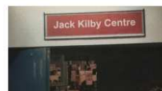
Figure 5: JKCC – if you're not here, you're not a computing student