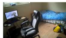
Figure 1: New beginnings: moving into a new home

There were many similarities drawn with existing literature, but it must be noted that much of the literature cited has used participants after transition. The level of understanding of the university environment and sense of motivation garnered from being part of the associate student route is a recognised conclusion for this study in helping to