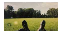
Figure 6: Chilling in the Meadows

understand the perceptions and experiences of associate students.